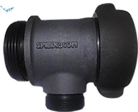
WIDGET™ - 2.5" WATER THIEF